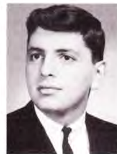
Stern in his 1963 Scarlet Letter yearbook photo.

Stern also is proud of the WNBA, a pro summer league for women founded by the NBA in 1997. He says that it's important that young women participate in sports and while the WNBA is still young and evolving, he is committed to its survival. “Look at your Lady Knights,” Stern says enthusiastically, referring to the Scarlet Knights women's basketball team's successful run in the NCAA tournament in 2005. He refers to the 2004 NCAA Championship game featuring UConn star Diana Taurasi, pointing out that, at the time, it was the highest-rated basketball program—